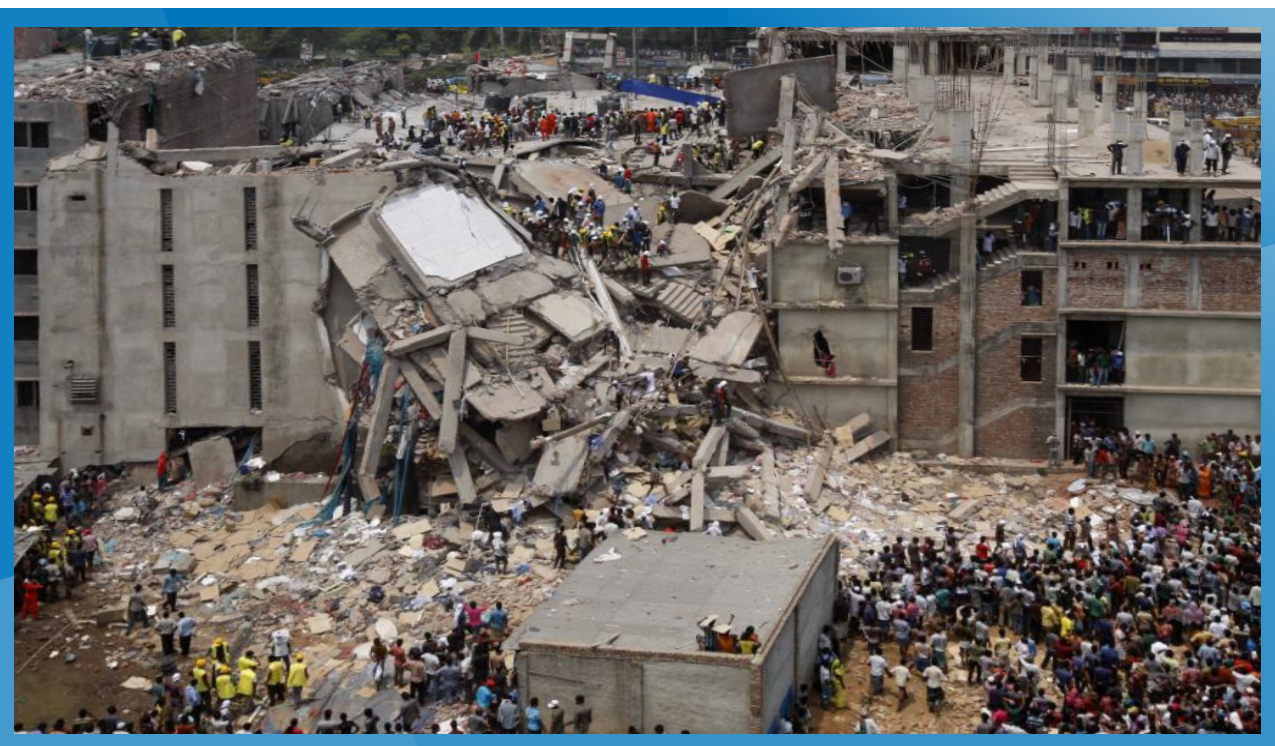
Wednesday, 24 April 2013, an eight-story commercial building named Rana Plaza, collapsed in Savar Upazila of Dhaka, Bangladesh. The search for the dead ended on 13 May 2013 with a death toll of 1,129. This image, originally posted to Flickr, was uploaded to Commons on 12 May 2013, by Rijans007. On that date, it was confirmed to be licensed under the terms of Creative Commons Attribution-Share Alike 2.0 Generic.

Because of ISO 45001, globalization can no longer be an option for companies that want to offload difficult and dangerous activities to low cost locations where there are lax labor laws. The extension of ISO 45001 in its reach will include suppliers and subcontractors that must apply the same standards as the core business so that the parent company can ensure its own compliance. That should be a wake-up call. Organizations within the retail and food and beverages sectors are characterized by being highly competitive and employing low skilled labor and reliant upon mostly global, supply chains. In the retail sector the Rana Plaza disaster of 2013 in Bangladesh was one of the worst ever industrial accidents in which 1,135 people were killed when an eight-storey building, housing five garment factories supplying global brands, collapsed.